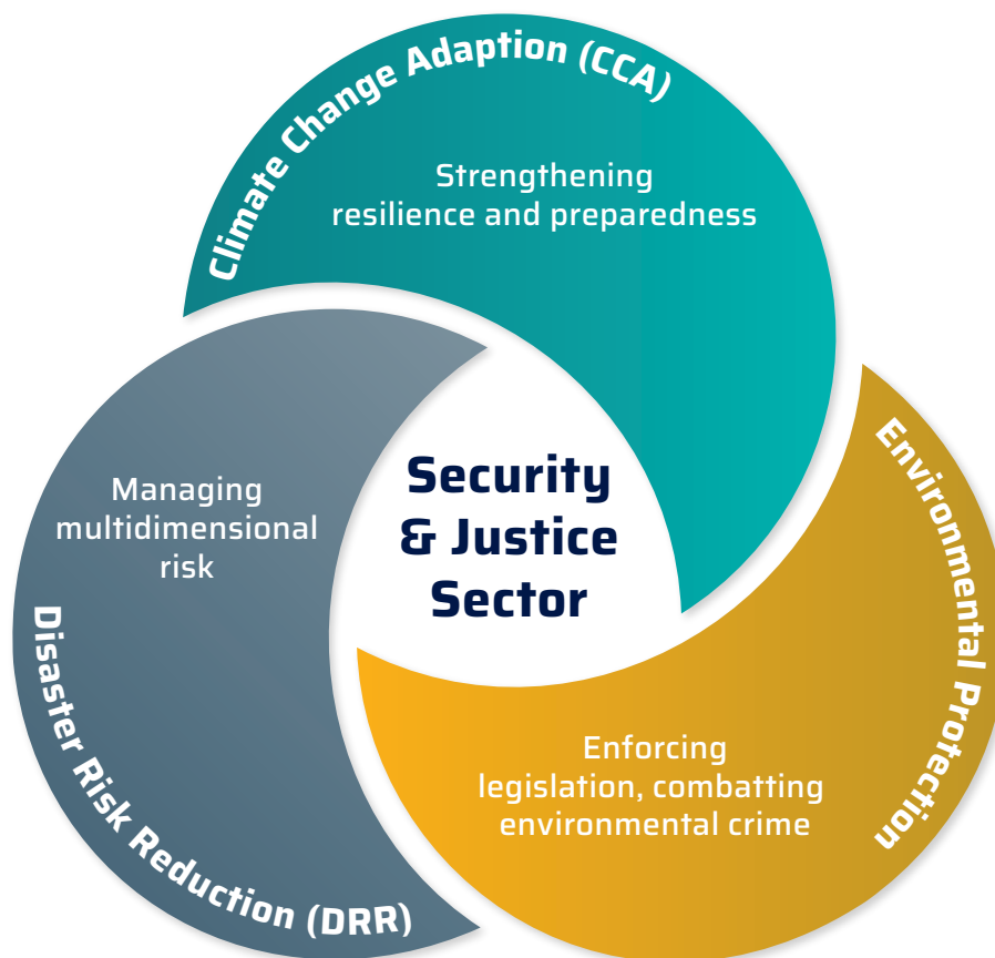
Figure 1: Security and justice sector roles in responding to environmental risks

Climate change and environmental degradation are impacting human security – whether through natural disasters of increasing frequency and severity, the potential of resource scarcity to exacerbate existing tensions and create new conflict dynamics, or long-term effects such as forced migration. A key question for governments and communities alike is: what might actually make us more secure in an era shaped by climate change? And what role can the security and justice sectors play, not only in responding to climate-induced crises but also in tackling the factors driving climate change to begin with? These are the questions which guided DCAF’s conversation with a panel of environmental and security experts on September 22, 2021. 1